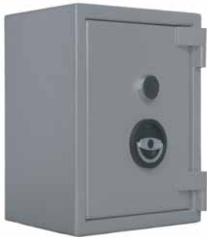
SEC SFEG 1015C