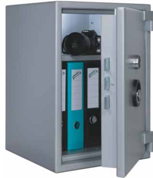
SEC SFEG 1055C

Larger sizes are available and information can be found on the Securikey web site www.securikey.co.uk