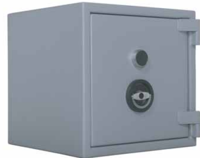
SEC SFEG 1035C