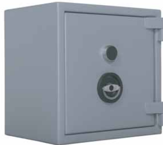
SEC SFEG 1025C