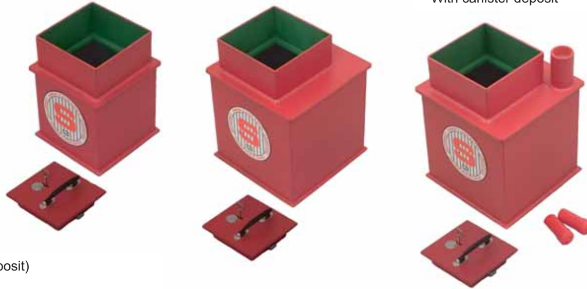
SECCKH 12" x 12" With canister deposit

This range of underfloor safes is designed for the domestic market or light commercial